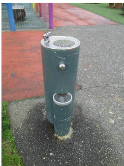
Figure 2: Example of fountain with side tap

Of the 11 working fountains, nine (82%) had side taps for filling water bottles or bowls (eg, see Figure 2), but none had attached bowls for dogs to drink from (in contrast to other drinking fountains we have seen elsewhere in New Zealand). From the lack of tarnish, scratches, and other evidence, all the fountains appeared to be less than ten years old, and had no evidence of vandalism. The flow from all the working nozzles was good (the water spout was more than 10cm from the nozzle). The water stream was sufficiently smooth for easy drinking in all cases, with the stream in Figure 1 being the most marginal case. The working fountains appeared to be well maintained, with the grass growing out of one (see Figures 1 and 2) an exception.