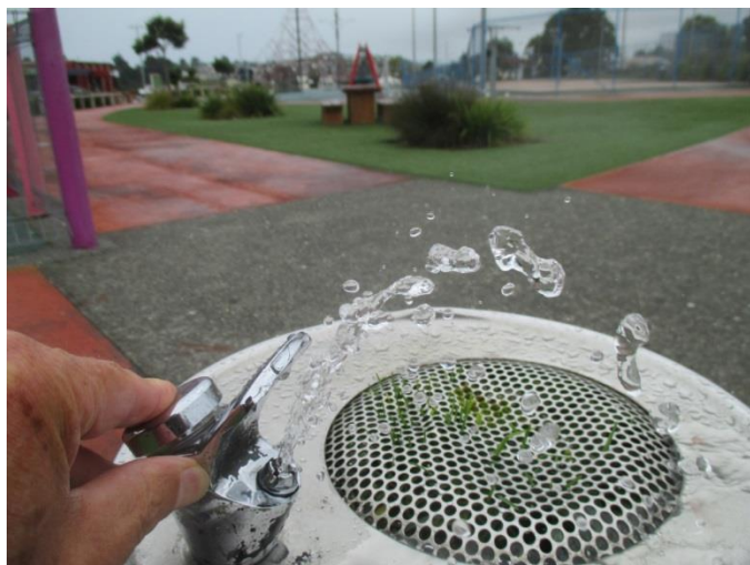
Figure 1: Poorly maintained fountain with grass growing in the drainage sink

The methods worked without any problems and all playground surveys took less than 15 minutes to conduct per site. This covered all photographs, testing of taps and data recording. Generally, between 10 and 20 photos were taken at each playground. The analysis of photos and notes for the features of interest (such as side taps) and for other relevant aspects of fountain context and design, took approximately 10 minutes per fountain. Photo quality was sufficient to see the type of water flow (see Figure 1).