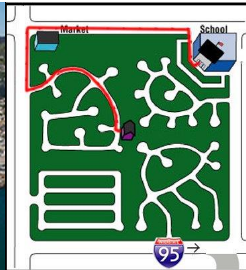
Driving-only transportation pattern